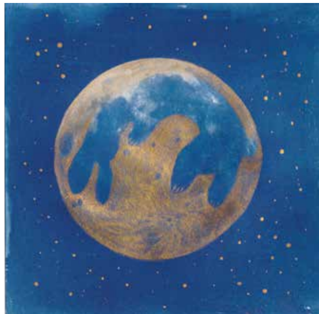
Bunny Moon – Norma Dycus Pennycuff