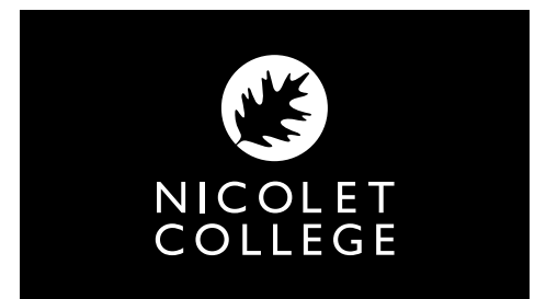
Stacked-centered Logo Reversed Out to White