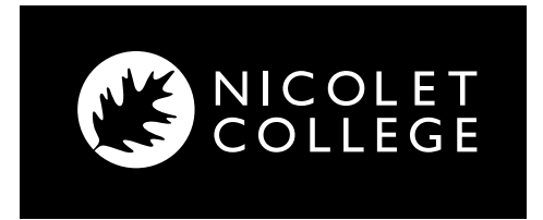
Primary Logo - Stacked Reversed Out to White