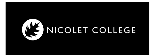
Single-line Logo Reversed Out to White