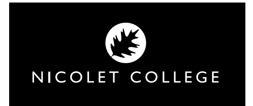
Centered Logo Reversed Out to White