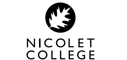
Stacked-centered Logo Black