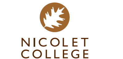
Stacked-centered Logo 2-color, CMYK, or RGB